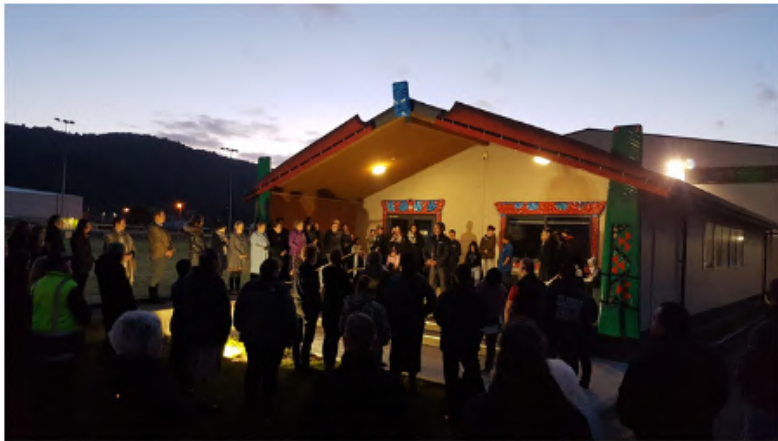
Dawn blessing of the unveiled whakairo, Te Whare Akoranga, Oct 2018

Greymouth High School is the largest school on the West Coast and more than half of our students bus in daily from as far as Punakaiki to the north, Serpentine (and a few from Hokitika) to the south, and Reefton and Otira to the east. The roll has risen due to students from other NZ regions moving into the area. The number of bus students and the size of the area involved affects school life as it impacts on after-school student activities and the ability of caregivers to maintain personal contact with the school, so the school encourages phone and text, email and social media contact. Communication with students, parents, whānau and the wider community is managed in a variety of media including newsletters, website, a school app, Facebook, Instagram, direct emails and texts from our SMS (Kamar) as well as Hāpara Workspace for teacher learning communications. We use a commercial radio contract (NZME) to reach people who may not use other forms of communication, with media students running in this, and receive frequent positive feedback about the impact of the radio.